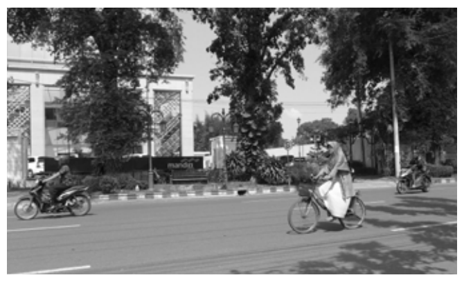
Women riding bicycles on roads are vulnerable to fast moving vehicles.

Despite the relative ease of bicycle use for women a number of barriers discourage their use, these range from cultural concerns about beauty, practical concerns about safety, as well as lack of supporting infrastructure and restrictive