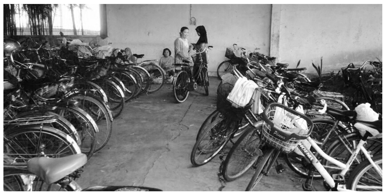
Solo is a national center of textile and plastic manufacturing, products that are exported internationally. These factories predominantly employ women laborers, many of whom ride bicycles to work. it is possible to introduce measures to further promote their use.