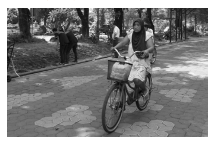
Bicycles offer a flexible way of shopping locally at many of Solo's traditional markets

Given the variety of transportation options available to women, why do they choose to ride bicycles?