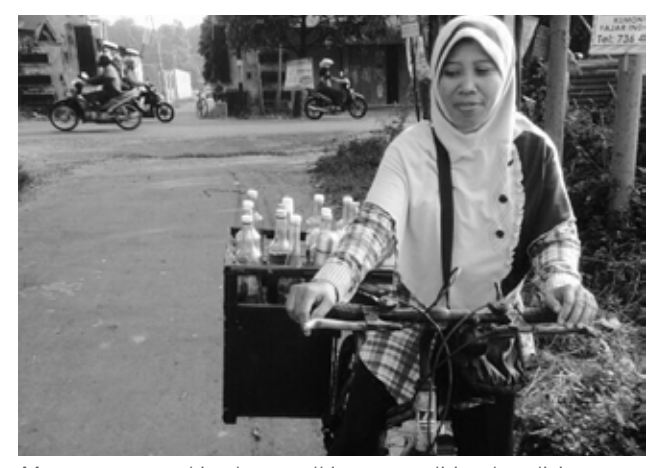
Many women use bicycles to sell jamu, a traditional medicine

There are a range of different reasons and uses why women use bicycles today. They vary between social classes. Bicycle use by women for commuting is declining, but its use for recreation is rising.