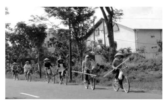
Female agricultural laborers commute to their jobs around the periphery of Solo from nearby villages

Bicycling is not a new phenomenon in Indonesia, it has been around since the Dutch colonial era and has been a popular form of transportation for generations: