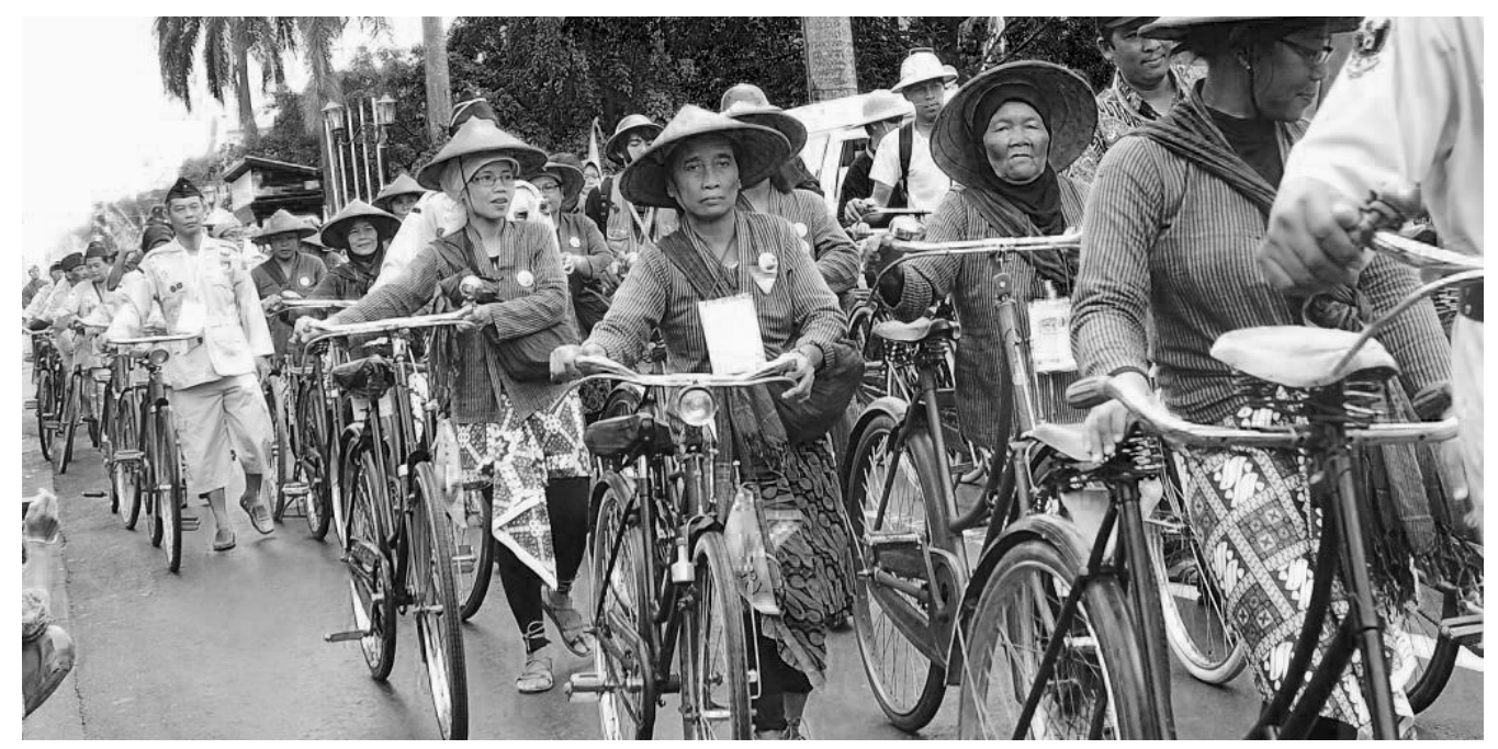
Textile and plastic factory workers commonly use bicycles to commute to and from work. Workers are predominantly women.