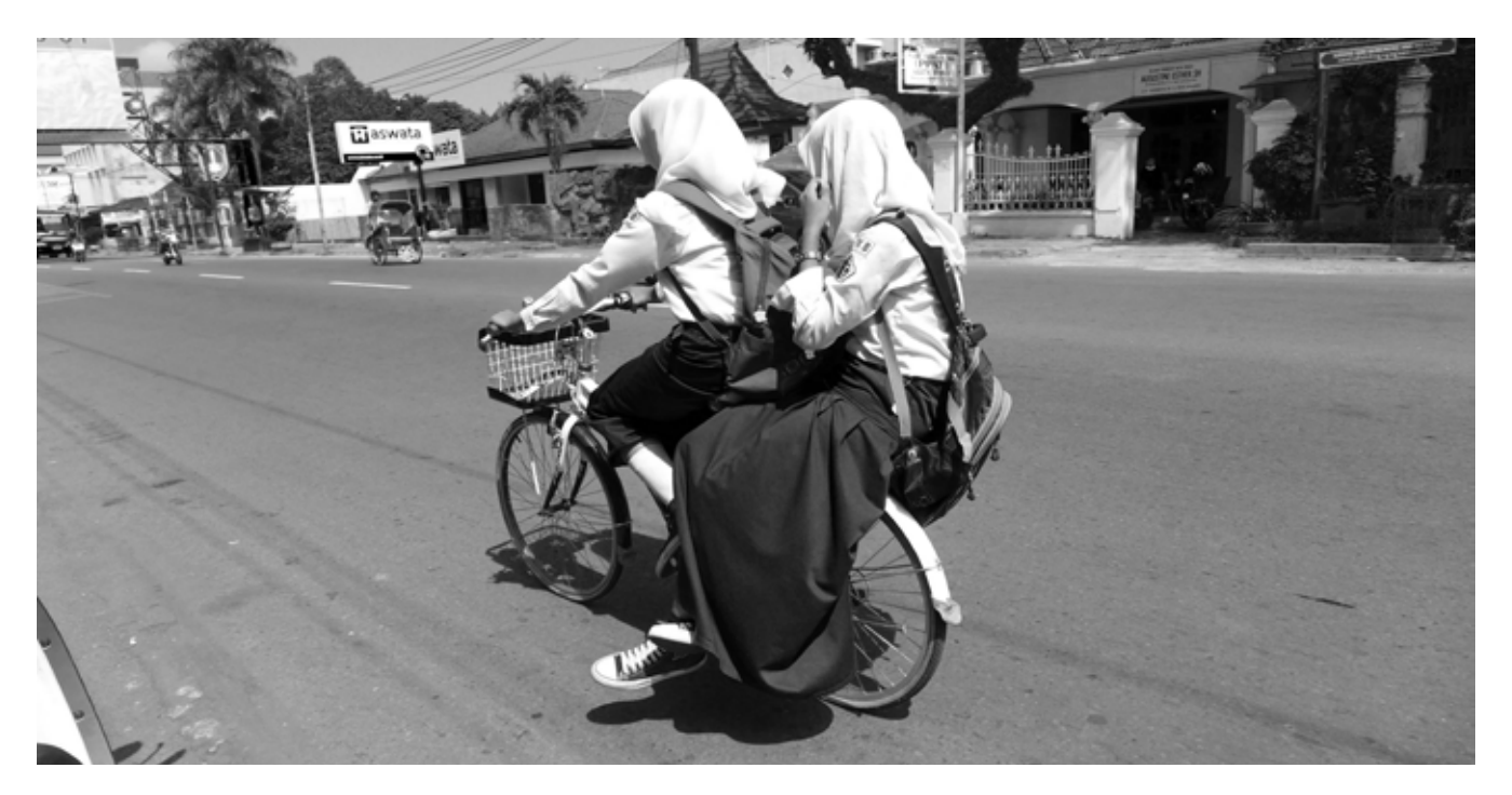
The city of Solo attracts students from all over Central Java. There are over 30 high schools and over a hundred junior high schools in Solo. Bicycling is a popular way for students to travel to school but safety and infrastructure are lacking.